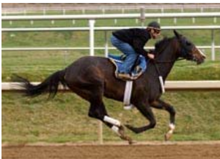
Sweetnorthernsaint during workout