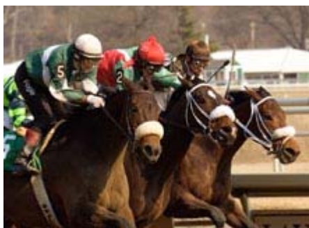
Silmaril (#5) wins her 9th stakes race

LAUREL, MD. 03-10-07 ---What on paper appeared to be a walk in the park turned into life and death circumstances for 1-5 favorite Silmaril as she rallied from last to win the $75,000 Conniver Stakes, today's feature at Laurel Park.