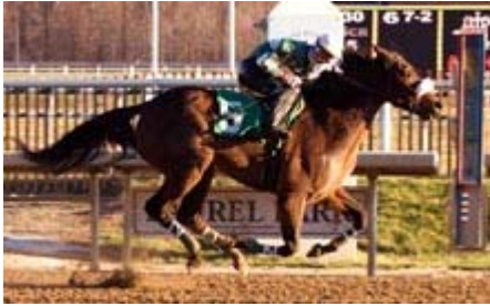
Silmaril