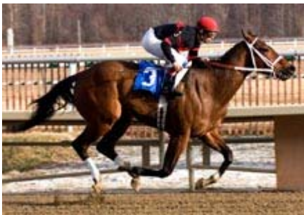
Call Me Clash