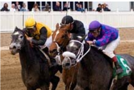
Laila's Punch #5