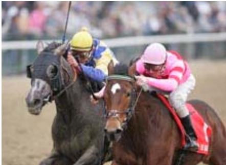
Take a Check (outside) is the morning line favorite for Friday's Winter Blues Overnight Stakes.

LAUREL, MD. 03-28-07 ---The Laurel Park racing office will present a rare weekday stakes on Friday. The $55,000 Winter Blues Overnight Stakes will bring together seven older fillies and mares who are set to race one mile on the main track.