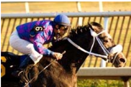
Laila's Punch in the Marshua Stakes

LAUREL, MD. 03-29-07 ---A mile might have been too far, but six furlongs could be just right when Laila's Punch meets six other fillies in Saturday's $90,000 Smart Halo Stakes at Laurel Park.