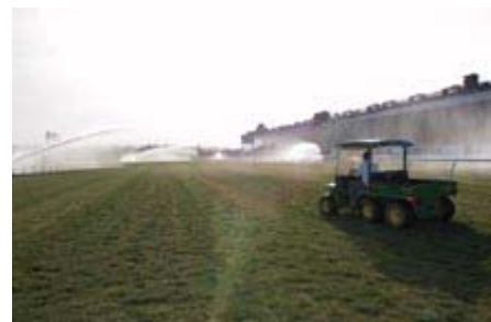
Turf being prepared under the watchful eye of Robbie Mitten

The popular Magna 5™ will end its fourth season this Saturday. The first leg of this week's wager will feature the initial turf race of the year at Laurel Park, a $30,000 allowance test at one mile. A full field of 14 is expected with top grass trainer Graham Motion sending out Clever Clover, the tepid 3-1 morning line choice.