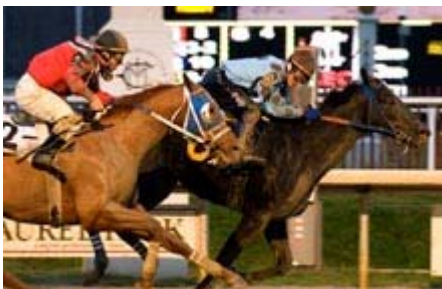
Heart Throbbin' and Place Your Bet finished 1-2 in the Dancing Count Stakes on Jan 1.