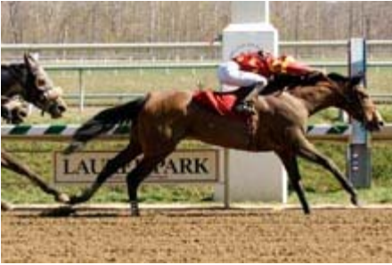
It's True Love