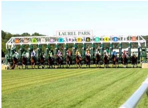
Fourteen horses break from the starting gate at Laurel Park.

LAUREL, MD. 12-02-05--- When the Laurel Park fall meeting began in September, Maryland Jockey Club officials had high hopes for its new turf course. After three months the grass courses have exceeded expectations.