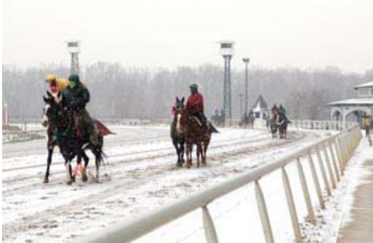
Snow falls at Laurel Park as the horses parade to post for Thursday's opener.

LAUREL, MD. 12-15-05 ---Racing officials braced for the worst, kicking off today's first race in the midst of a driving snow storm. By post time for the second race, the snow had stopped and they were able to present the entire nine-race card despite light freezing rain throughout the afternoon. Last Friday, Laurel officials braved a dire weather forecast and were able to complete the card as several inches of snow hit the region.