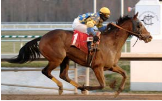
Magical Broad earns her first stakes victory in the Squan Song S.

LAUREL, MD. 12-17-05 ---Fitzhugh LLC's Magical Broad didn't get much play at the betting windows today, but she turned out to be a serious player when she powered to victory in the $50,000 Squan Song Stakes for Maryland-bred fillies and mares, the feature race this afternoon at Laurel Park.