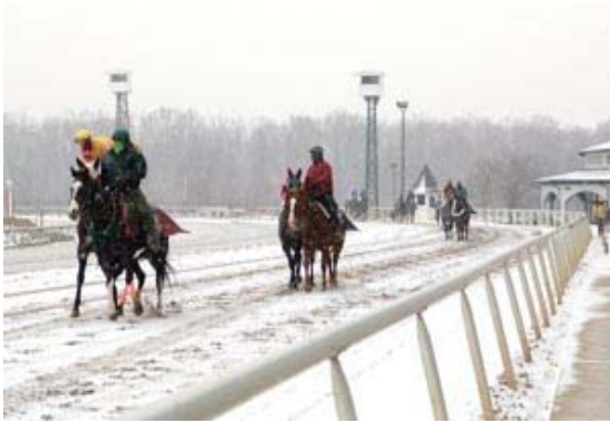
Snow falls at Laurel Park as the horses parade to post for Thursday's opener.