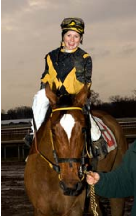
Rosie Napravnik returns to the winners' circle aboard Promenade Girl. It was the 17-year-old's first win since mid November.