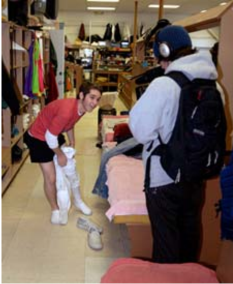
Actor Ryan Pinkston suits up in the Laurel Park jocks' room.

LAUREL, MD. 12-22-05 ---Hollywood came to Laurel Park Thursday afternoon when 17-year-old actor Ryan Pinkston appeared at the central Maryland track to shoot promotional videos for his half hour comedy pilot called "5-0" which was sold to NBC last month.