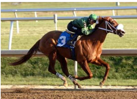
Unbeaten Celestial Legend heads Monday’s feature.

LAUREL, MD. 12-23-05 ---After winning all her preliminary bouts, Celestial Legend goes into the main event as the overwhelming 7-5 morning line choice to win the $75,000 Maryland Juvenile Filly Championship, scheduled as the sixth race on Monday, December 26.