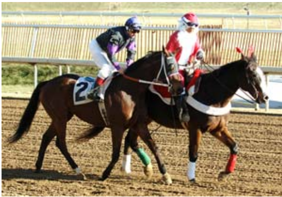
Santa Clause shows off his horsemanship during a Laurel Park post parade.

The Maryland Jockey Club will take a two-day break from racing for the Christmas holiday. Live racing returns to Laurel Park on Monday, December 26 highlighted by the Maryland Juvenile Filly Championship. The top two-year-old boys in the state will compete in the $75,000 Maryland Juvenile Championship on New Year's Eve.