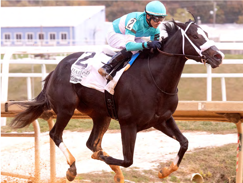
Hello Beautiful winning the 2021 Maryland Million Distaff.