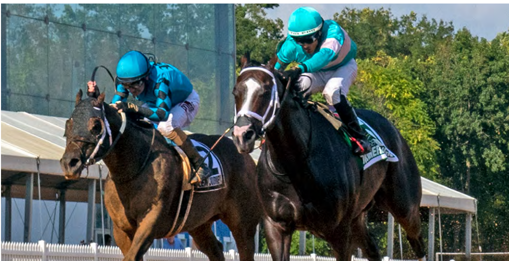
Jalen Journey (outside) was elevated to first in the 2021 DeFrancis Dash.

The Frank J. De Francis Memorial Dash is one of the elite sprints in the country.