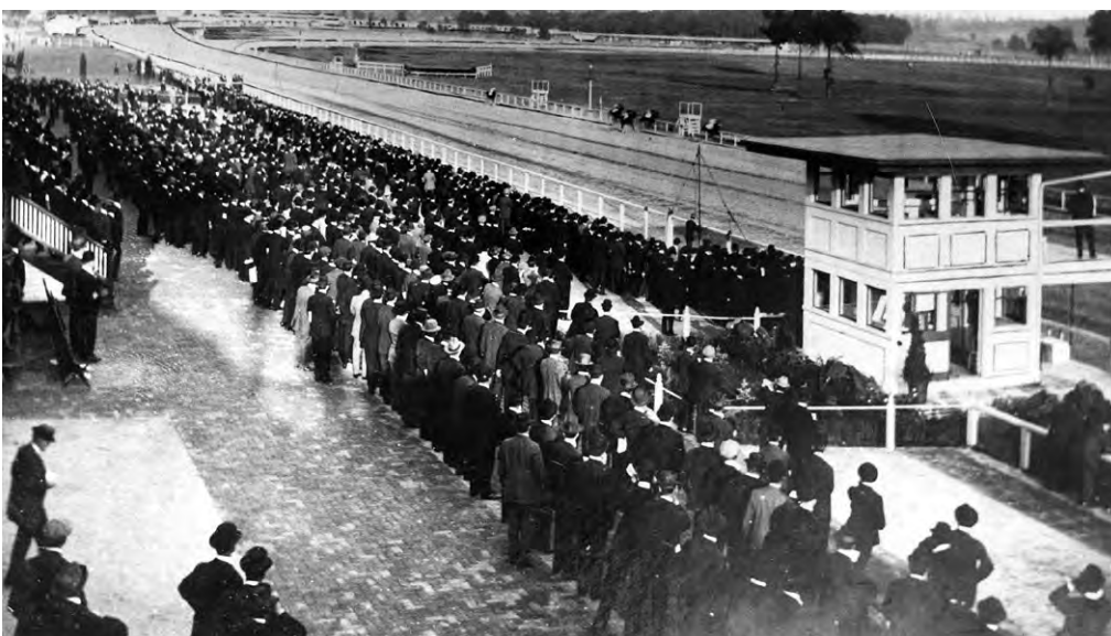
Laurel Park opened on October 2, 1911.