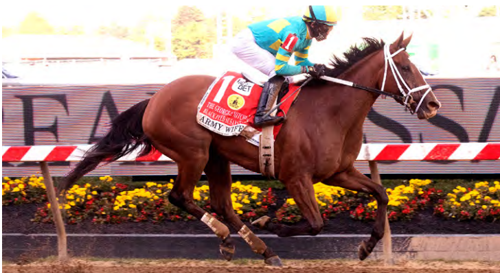
Army Wife winning the 2021 Black Eyed Susan Race at Pimlico Race Course.

Not run from 1932 to 1936, inclusive, nor in 1950. Distance 1 mile and 70 yards in 1930; 1-3/16 miles in 1951; 1-1/8 miles in 1952. Run at 1-1/16 miles from 1919 to 1929 inclusive; 1931 to 1949 inclusive and from 1953 to 1988. Run as Pimlico Oaks prior to 1951.