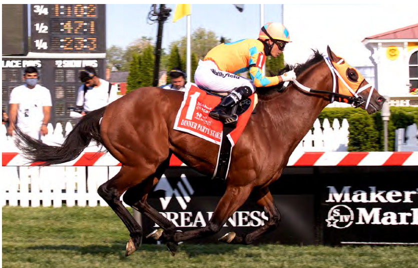
Somelikeithotbrown winning the 2021 Dinner Party Stakes.