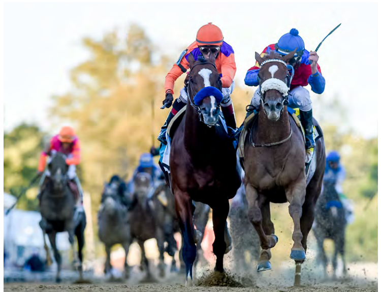
Pimlico is home of the Preakness, the middle jewel of racing's Triple Crown.

En route to becoming a true national treasure, Pimlico has earned its patina of age, weathering small and major wars, recessions, depressions – including the Great Depression of the 1930's – fires, storms . . . and the simple passage of time. Its vitality has spanned many an era, representing a time and a society now involving three centuries. More than 50 years ago, the youthful president of the Maryland Jockey Club, Alfred G. Vanderbilt, made a pertinent observation that remains today, as Pimlico moves into another century: "Pimlico is more than a dirt track bounded by four streets. It is an accepted American institution, devoted to the best interests of a great sport, graced by time, respected for its honorable past."